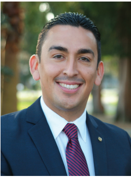
Alfredo Pedroza Napa County Board of Supervisors, District 4